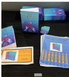
Avital O'Glasser, writer